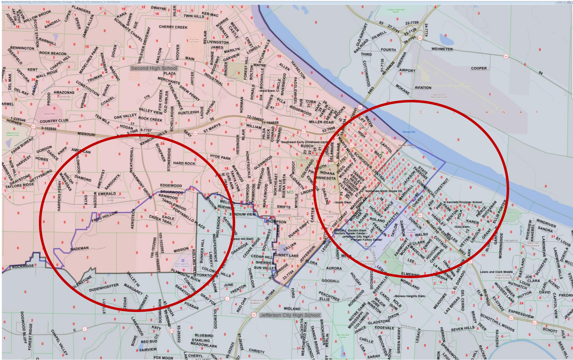
Circle 1 has students attending Lewis and Clark MS and going to the 2 nd HS. Circle 2 has students attending Thomas Jefferson MS and going to the current HS.