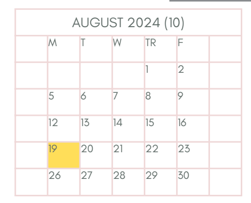
AUGUST 19: FIRST DAY OF SCHOOL