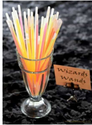
Glow Sticks aka "wizard wands"