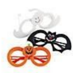
Goofy Halloween Glasses