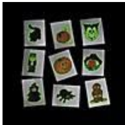
Halloween Glow in the Dark Tattoos