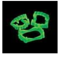
Glow in the Dark Vampire Fangs