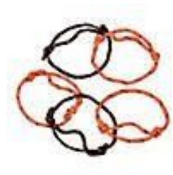
Halloween Friendship Rope Bracelets

*Instead of passing out candy, let students fill a goody bag with party favors! This can end up costing the same amount as handing out candy or cheaper.