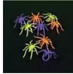
Colorful Halloween Spider Rings