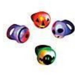
Flashing Halloween Light Up Rings